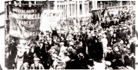
Camberwell Trades Council, Mayday demo, 1926