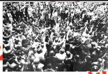
Sit-in against racist attacks, 1978

Fascists in the area: Union Movement at Kerbela St (1960s), 1960s British National Party Cheshire St/Brick Lane, National Front 1970s, BNP 1980s-90s... encouraging racist vio- lence... but resisted by anti-fascists and locals