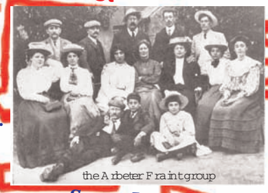
the Arbetter Fräintgroup

Poilshe Yidel , first socialist paper in Yiddish, 137 Commercial St