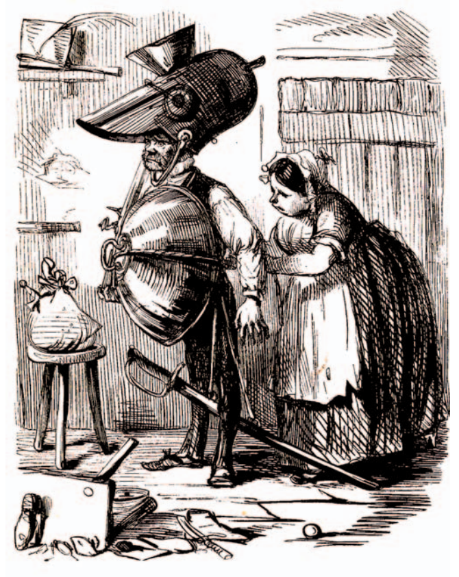
A Physical Force Chartist arming for the fight, as satirised in Punch.