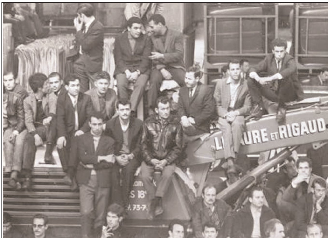
Workers occupying Renault-Flins

At the morning meeting it had above all been a question of solidarity with Cléon. In the afternoon, one of the unions presented a list of demands: “40 hours without loss of pay; 1000 francs minimum wage; retirement at 60 (55 for women); five weeks holiday for young people; cancellation of the regulations; trade union rights” .